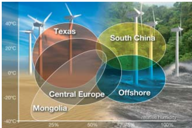
Figure 1: Different climatic requirements exist, depending on the intended location of the WPU. For instance, the extreme climate conditions in China and Mongolia are somewhat conflicting as regards temperature and relative humidity, which is why the power electronics system used here has to be adapted to meet these very requirements.

Wind turbines are being designed to cover an increasingly larger power range, although the location is the all-important factor for the output. In onshore wind turbines 3 MW turbines have proven to be most economic, while offshore wind farms with an output of 5 MWs and above are the better solution. If both types of wind power unit – doubly-fed asynchronous machine and synchronous/asynchronous generator with a full-size converter – are to be able to provide the same output, the power of the full-size converter has to be five times higher. This in turn means that five times the power electronics is needed. As, however, the low output frequencies of doubly-fed asynchronous machines have to be taken into account, this is normally reduced to an increase by a factor of 3 – 3.5.