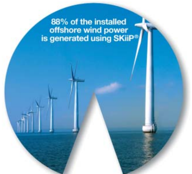
Figure 2: 88% of the total 1,471 MW of offshore wind power (as per 2008) is generated using SKiiP modules

Different locations mean different requirements and problems. This is something Semikron is very aware of and has factored in to the improvement of its IPMs. The SKiiP family is already in its 4th generation. Maximum reliability and prolonged service life in compact designs is top priority in wind turbines, especially because system maintenance is costly and complex, and results in financial loss due to loss of income during downtimes where no electrical energy is produced. Reliability throughout the WPU's minimum service life of 20 years is down to the SKiiP modules and their reliable high quality packaging technology. This is an important merit, especially given the increasing tendency towards offshore wind farms.