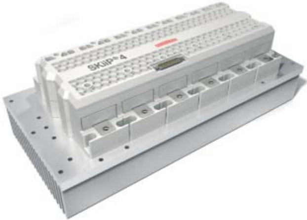
Figure 3: SKiiP 4, maximum reliability and prolonged service life in compact designs

Thanks to the optimum chip distribution on the insulating substrate (DCB), the low-inductance module design and symmetric current distribution, the power density of SKiiP modules is around 20 times that of competitor products. All SKiiP modules come as a unit comprising heat sink, power electronics and gate drivers. Customers have two standard heat sinks to choose from, or may opt for a custom-developed heat sink solution.